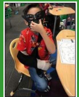
Student enjoying Globe Trot Scott Activities.