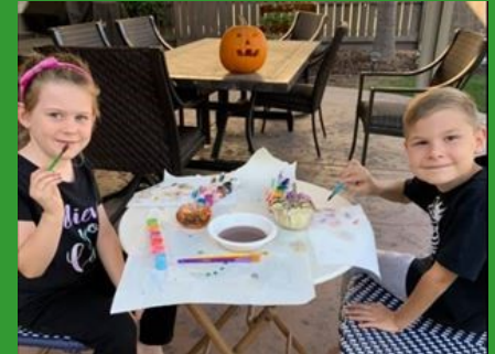
PSP Virtual Family Fun Nights— Halloween and Camp Out Editions.

The Covid19 Pandemic has affected all of us on various levels and presented us with unanticipated challenges. Thank you for continuing to stay engaged, for adapting to all of the challenges that have come our way, and for being supportive of our campus community. Your generosity makes our community stronger. Go Gators!