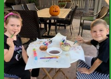
PSP Virtual Family Fun Nights— Halloween and Camp Out Editions.

The Covid19 Pandemic has affected all of us on various levels and presented us with unanticipated challenges. Thank you for continuing to stay engaged, for adapting to all of the challenges that have come our way, and for being supportive of our campus community. Your generosity makes our community stronger. Go Gators!