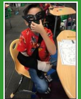
Student enjoying Globe Trot Scott Activities.